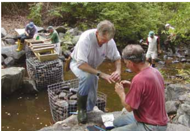
Building Millrace Foot Bridge

Most trail work can be done by one or two people and the tools of the trade are simple - pruning shears and