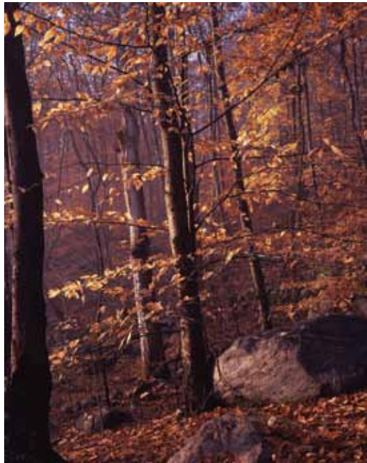
Trees and stone come together at Canfield Meadow Woods

We're following the Orange Trail, past tulip and poplar trees and an old Wolf tree, left over from when the land was pasture. "It's incredible to think that this was farm country," says Hill. But the criss-crossing stone walls are a reminder that these were farmers' fields. We reach the "cave rock" on the Black Trail, where we rest – just as others have before us. "You just get the feeling that people have used this as a shelter," says Hill, whose